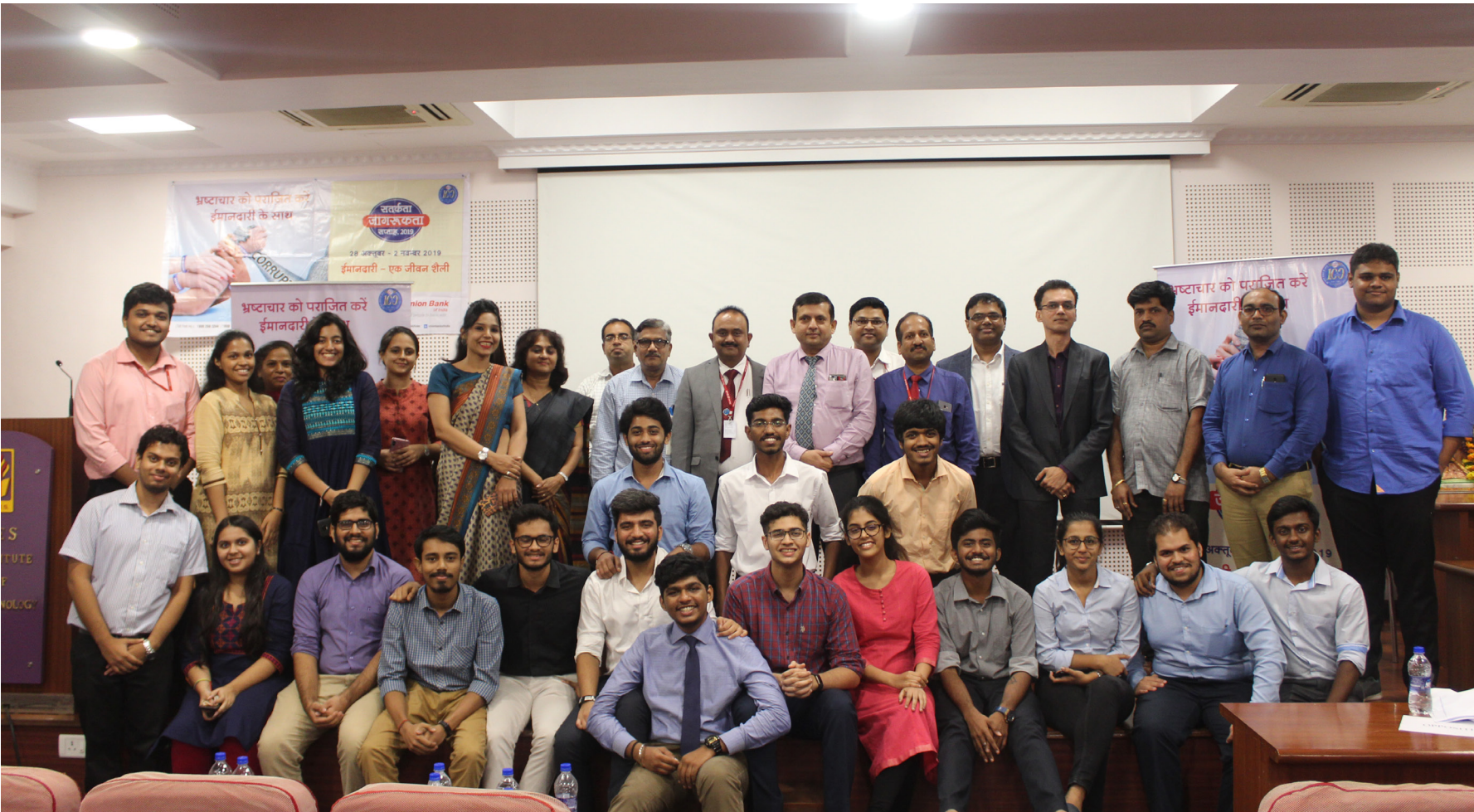
VESLIT Team with the esteemed guests from UBI