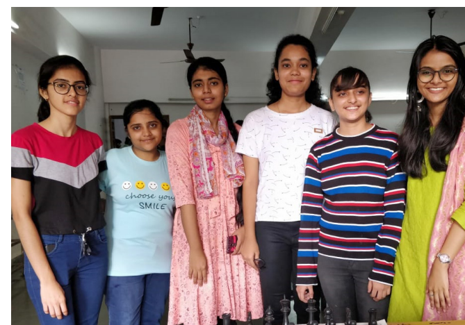
Chess girls team Winners(D5) and Runner ups(D2C)