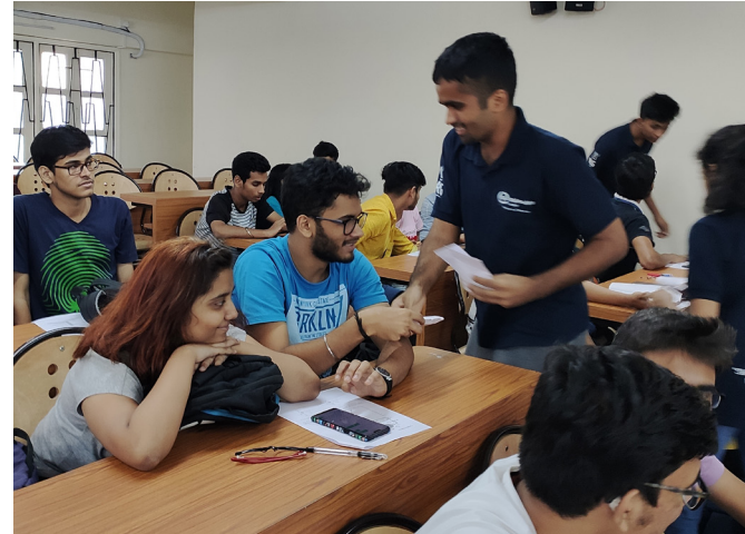
SE coordinators distributing the circuit components