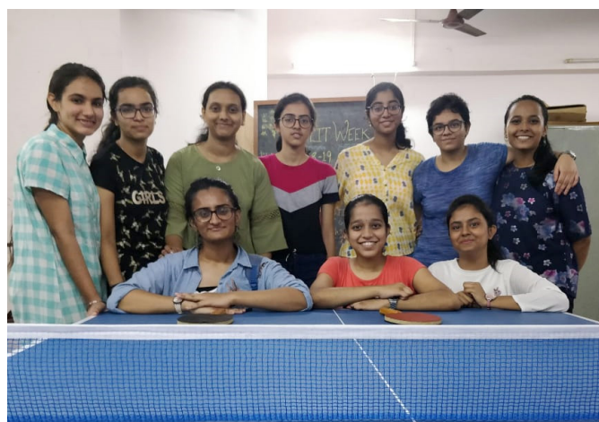
Table tennis girls team Winners(D1) and Runner ups(D2C)