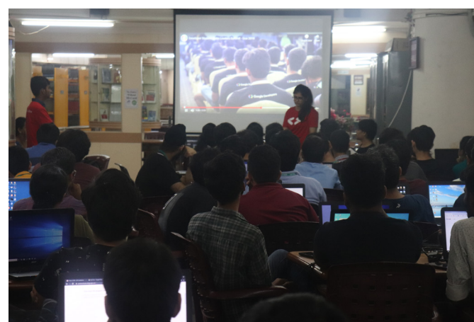
All participants were shown an introductory video before the workshop