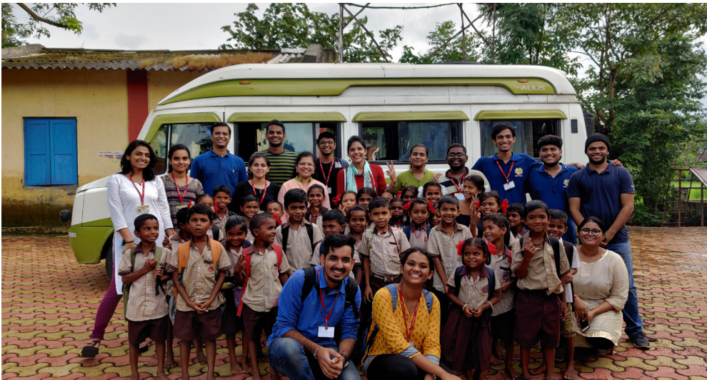
Team Amgaon alongside the smiling school kids

“They joined hands. So the world ended. And the next one began.” - Sarah J. Maas,