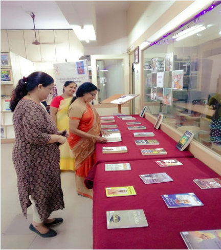
Principal Ma'am at the book exhibit in the college library

On 15th October 2019, the birth anniversary of the former President and The Missile Man of India, Dr. A.P.J Abdul Kalam , VESIT celebrated the “ Vachan Prerna Diwas ” in association with the Free Press Journal. Various books authored by Dr. Kalam and other legendary authors were displayed in the library. A rangoli was also made in the library to honour our former President, Dr. Kalam.