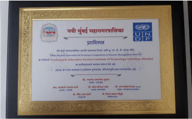
Certification awarded to VESITians for their project

NMMC received 54 project proposals from various engineering colleges from Mumbai, Navi Mumbai, Panvel, and Thane region including IIT