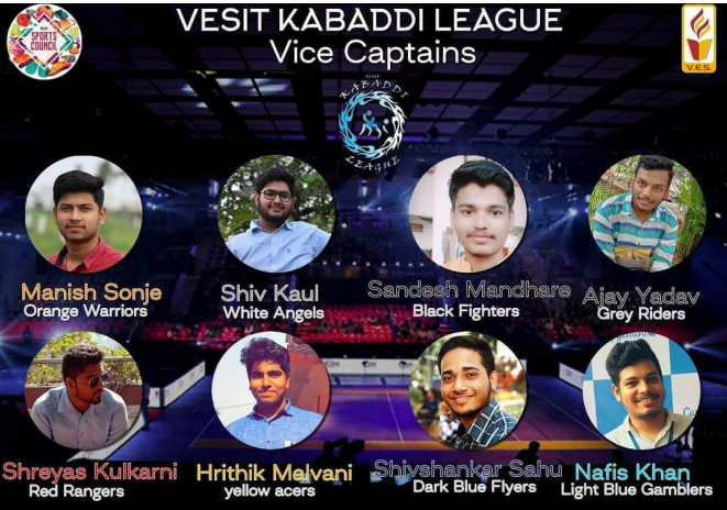
Vice Captains of VKL 2020