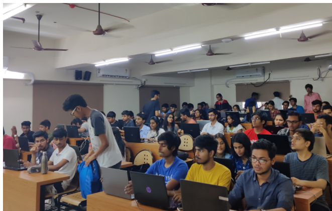
The event was conducted in a smart classroom with a large turnout on both days

Day 2 focused on concluding the designing part of the application followed by its implementation. As they were designing, the participants were made aware of various features of Java, its advantages and also a few disadvantages. Once the application was done, the teams were asked to connect the laptops to their mobile phones and run the application, thus enjoy playing the game that they, them-