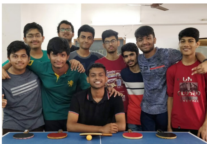
Table tennis boys team Winners(D1) and Runner ups(D2)