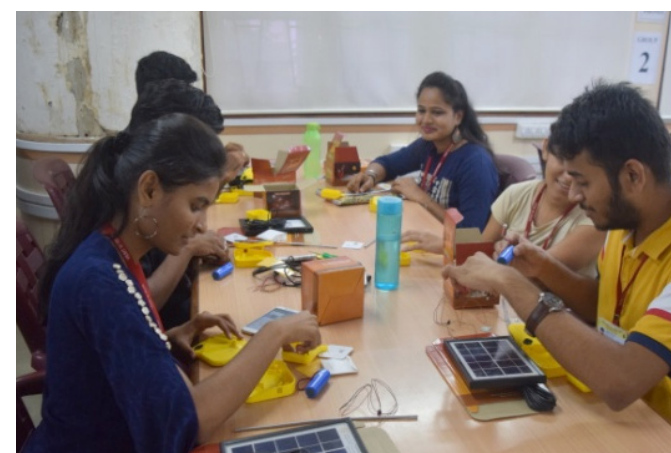
Students engaged in assembling the Solar lamp

The post-lunch session was conducted in the library where the students were provided with the solar-kits and were then asked to assemble the solar lamp followed by testing. On completion of the assembly, the students proceeded for a photograph session after which were asked to write a test under the solar lamps they assembled.