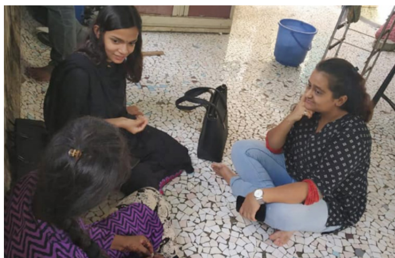
Mentors from weCHANGE interacting with the beneficiaries from Kshamata

Around 30 mentors have already signed up for supporting the 70 young students and have already started to help them with their educational needs and provide moral support. Indeed with such an initiative, the world is bound to change. Rabindranath Tagore's dream of India where all citizens are able to live a life with dignity and self-respect can only be achieved if the youth of the country come forward to help their brethren!