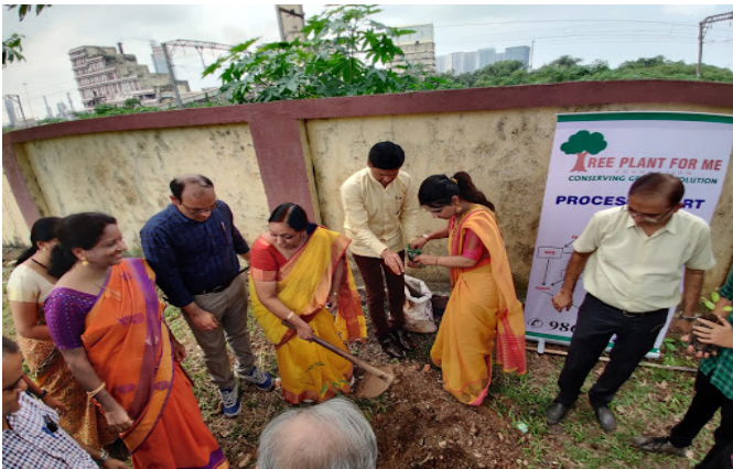
Vice-Principal along with VESIT faculty planting saplings