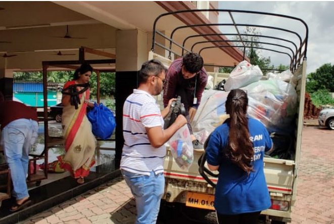
The 200kg of plastic waste being loaded into the truck by volunteers