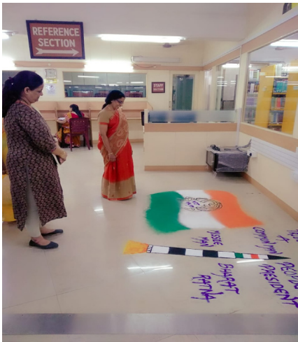
The Rangoli honouring The Missile Man of India