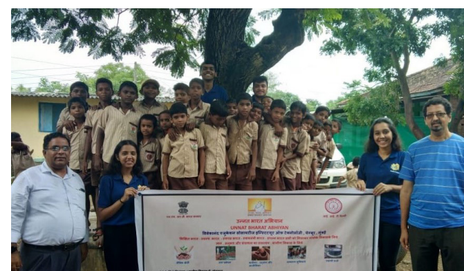
Team Asnas along with the school kids

The Ambisthe Kh village consists of around 40% Adivasi who have no proper shelter, water or electricity.