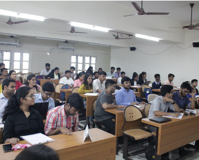
Glimpse into the diplomatic environment of MUN committee 1

This week encapsulates all forms of expression and aims to select the best students at VESIT for further competitions. With the week long program being celebrated in the beginning of October each year, VESIT’s literature group, The VESLit Circle, works hard to make this event a huge success. This year, they have definitely succeeded. Read on as we try and capture the essence of the entire week for you!