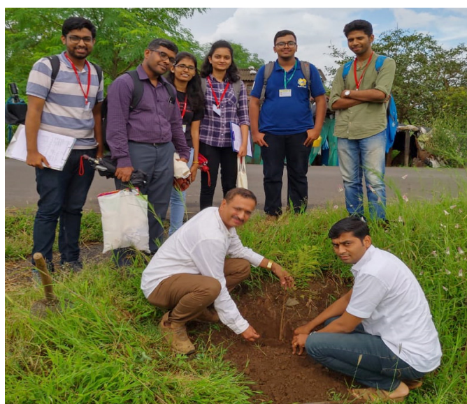
Team Aпти commences the tree plantation campaign

Unnat Bharat Abhiyan is a flagship program of Ministry of Human Resource Development, Government of India. It is inspired by the vision of transformational change in the rural areas of India through the means of development by the influence of the premier institutions in order to formulate and architect an Inclusive India. As per statistics provided by the World Bank collection of development indicators, compiled from officially recognized sources, the total rural population of India was reported at 66.64% in 2017. According to International Journal of Agriculture and Food Science Technology, around 70% of them depend on agriculture as their primary source of income and yet they