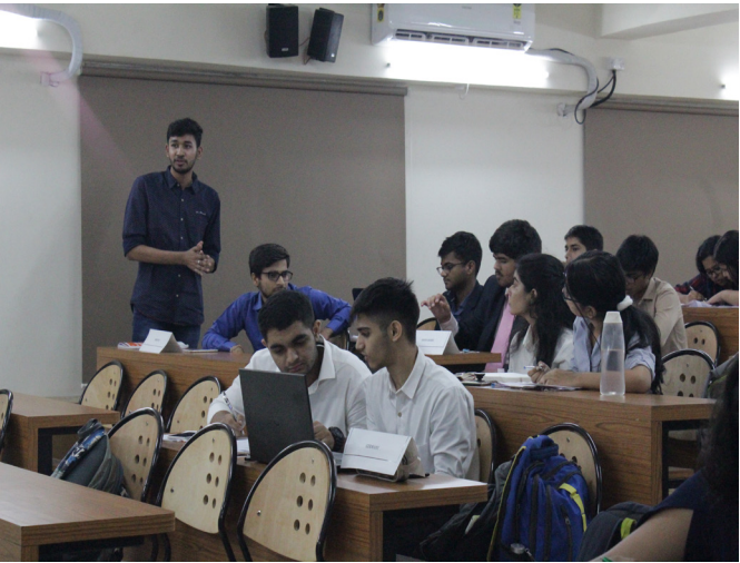
Diplomats at the VESLIT MUN